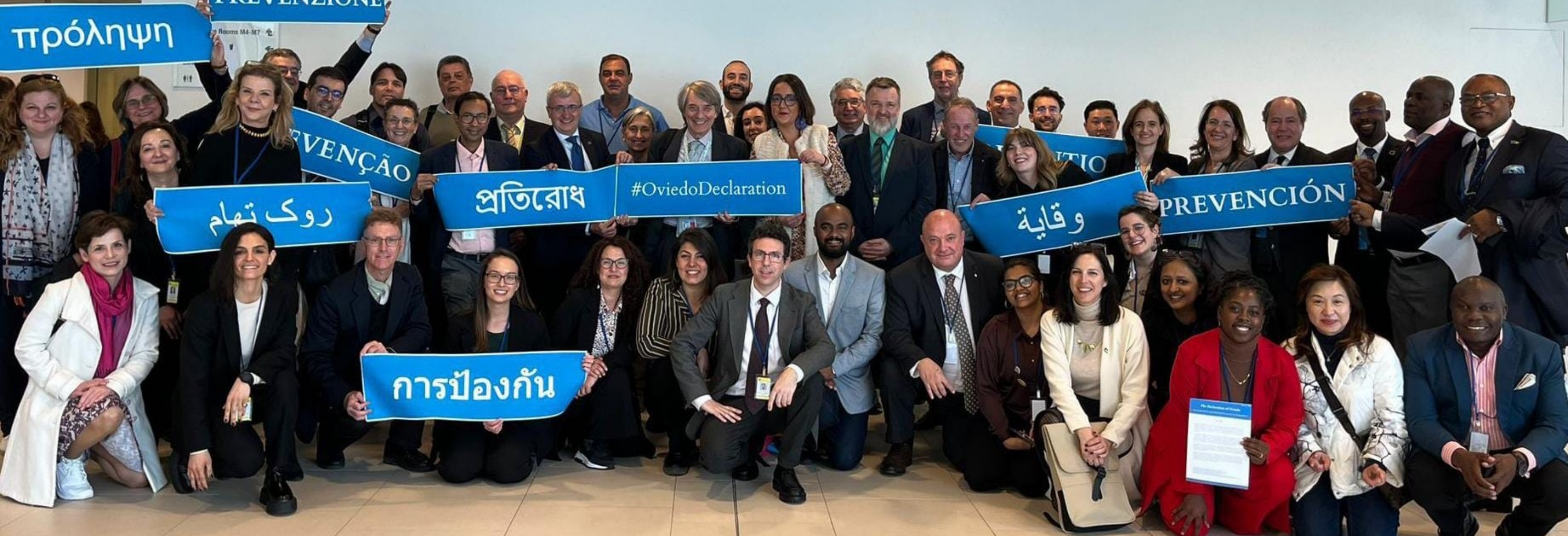
67 th United Nations Commission on Narcotic Drugs March 2024