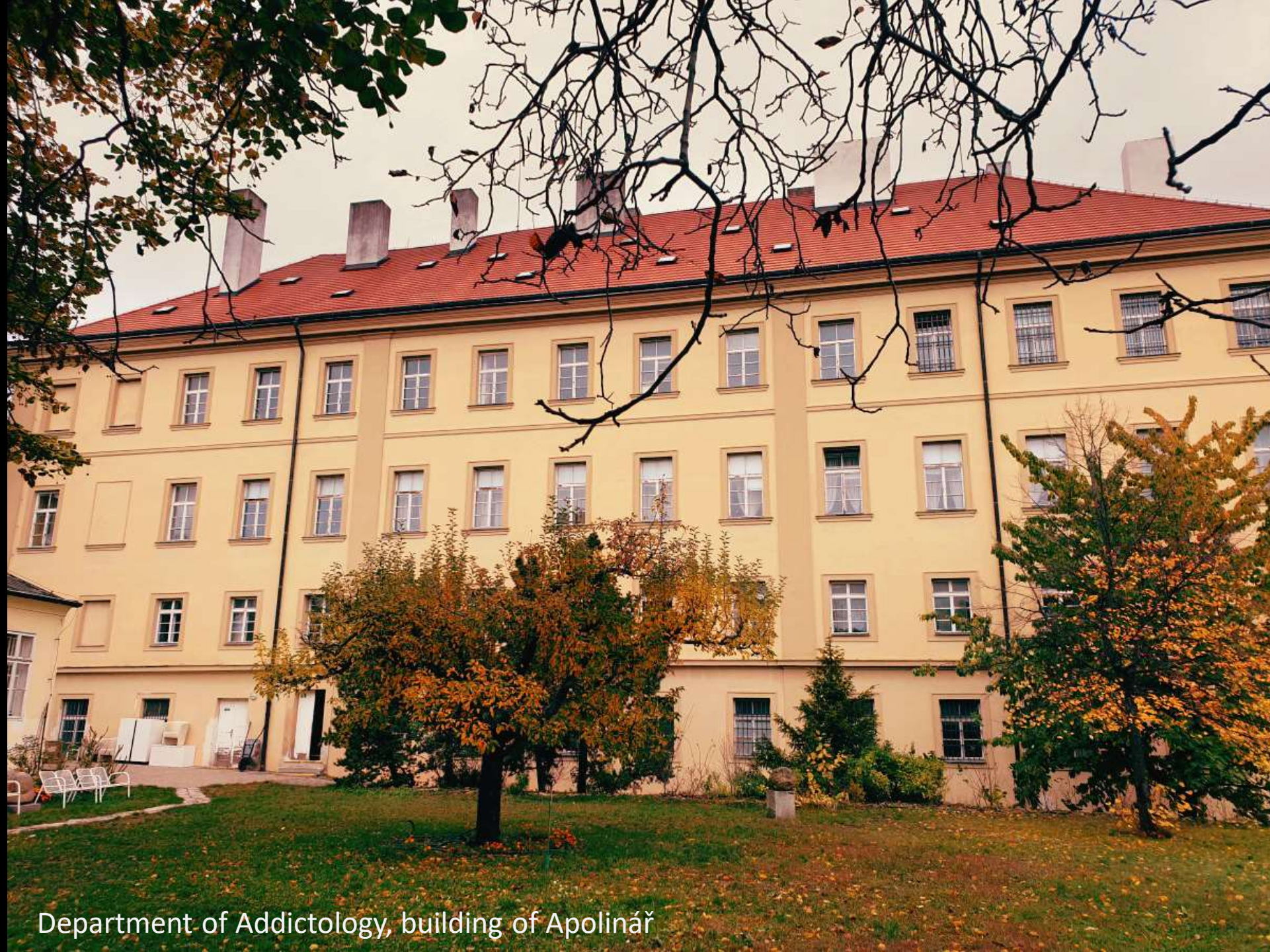
Department of Addictology, building of Apolinář