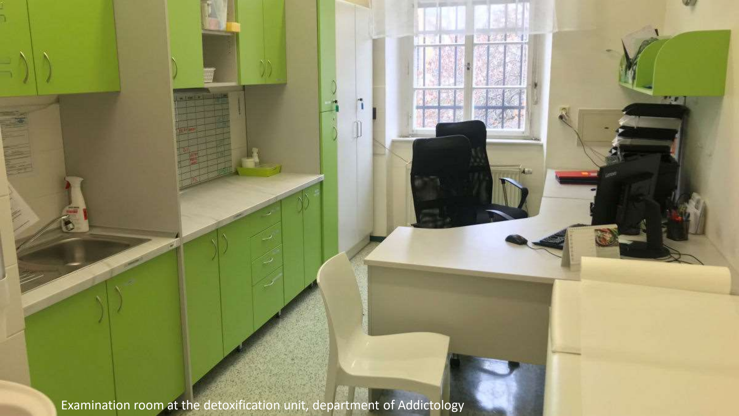
Examination room at the detoxification unit, department of Addictology