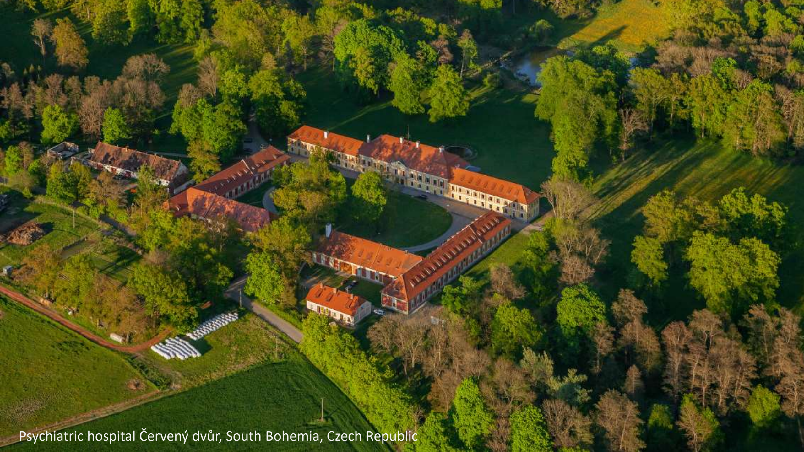
Psychiatric hospital Červený dvůr, South Bohemia, Czech Republic