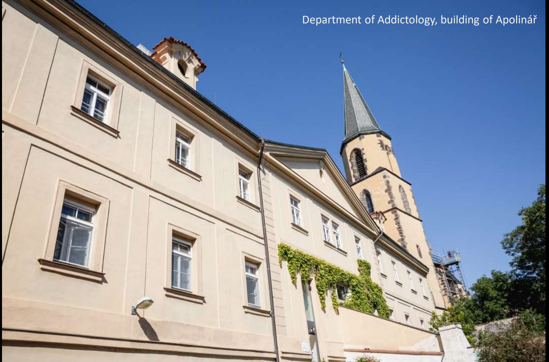
Department of Addictology, building of Apolinář