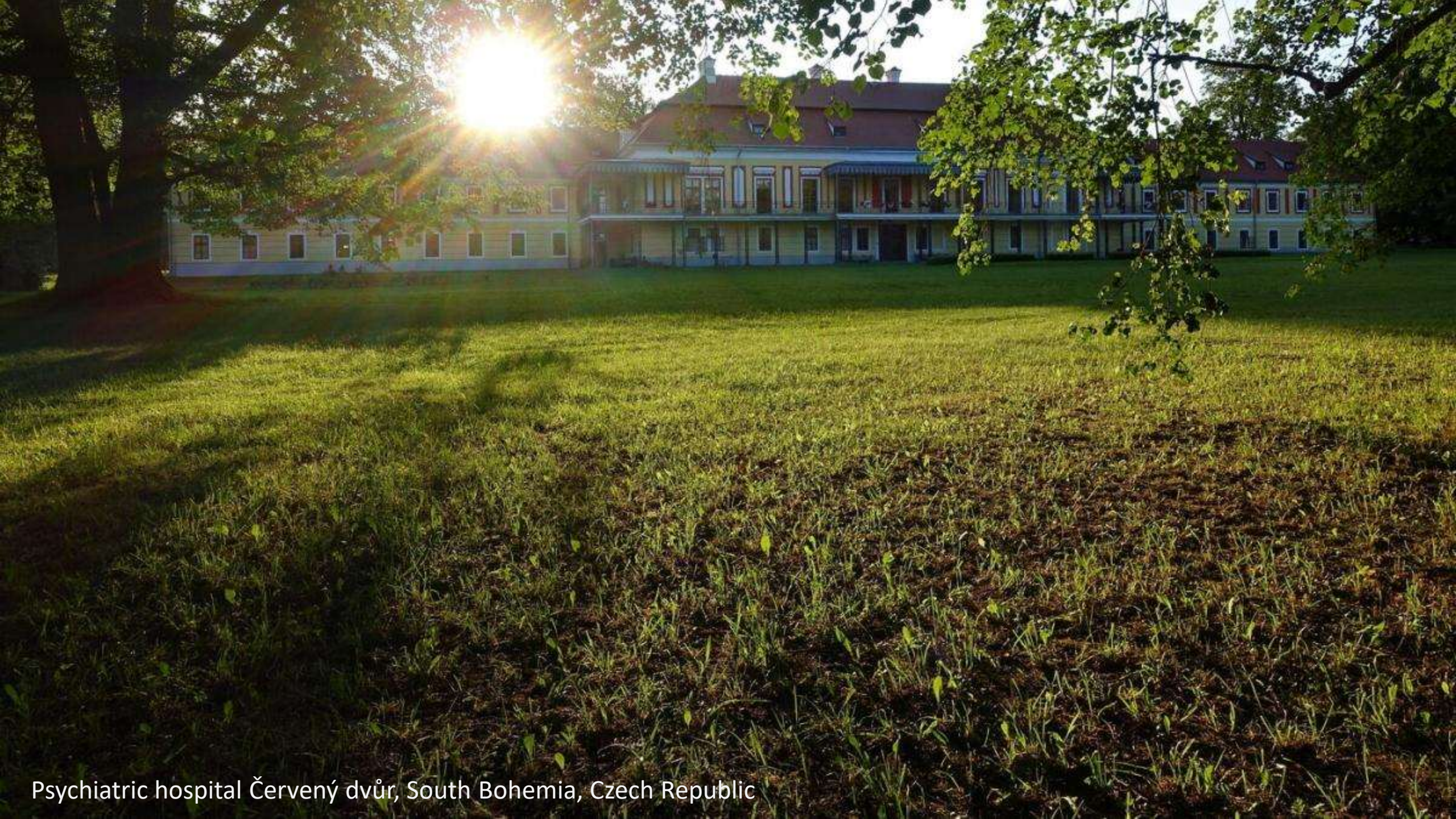
Psychiatric hospital Červený dvůr, South Bohemia, Czech Republic