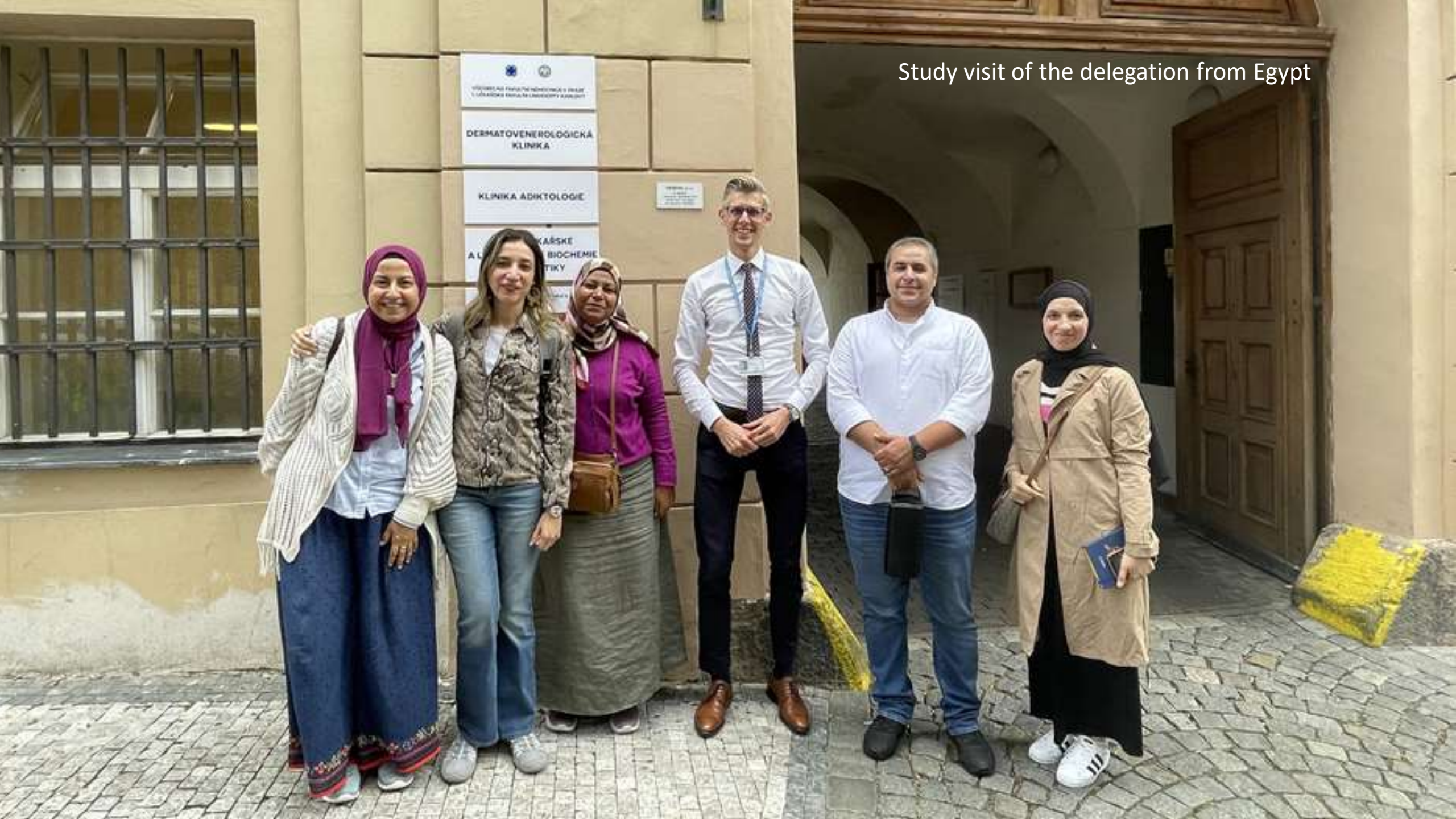
Study visit of the delegation from Egypt