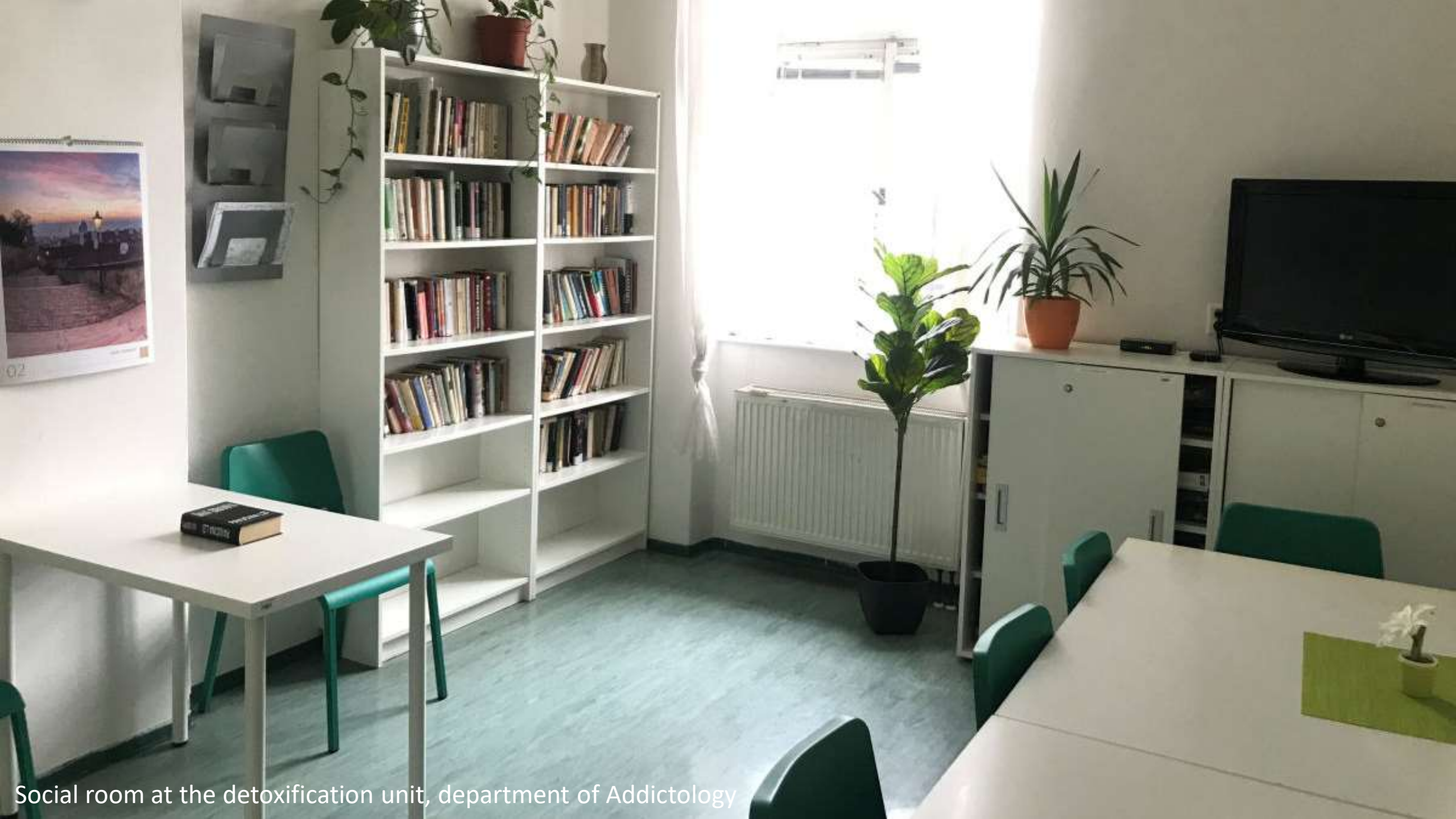
Social room at the detoxification unit, department of Addictology