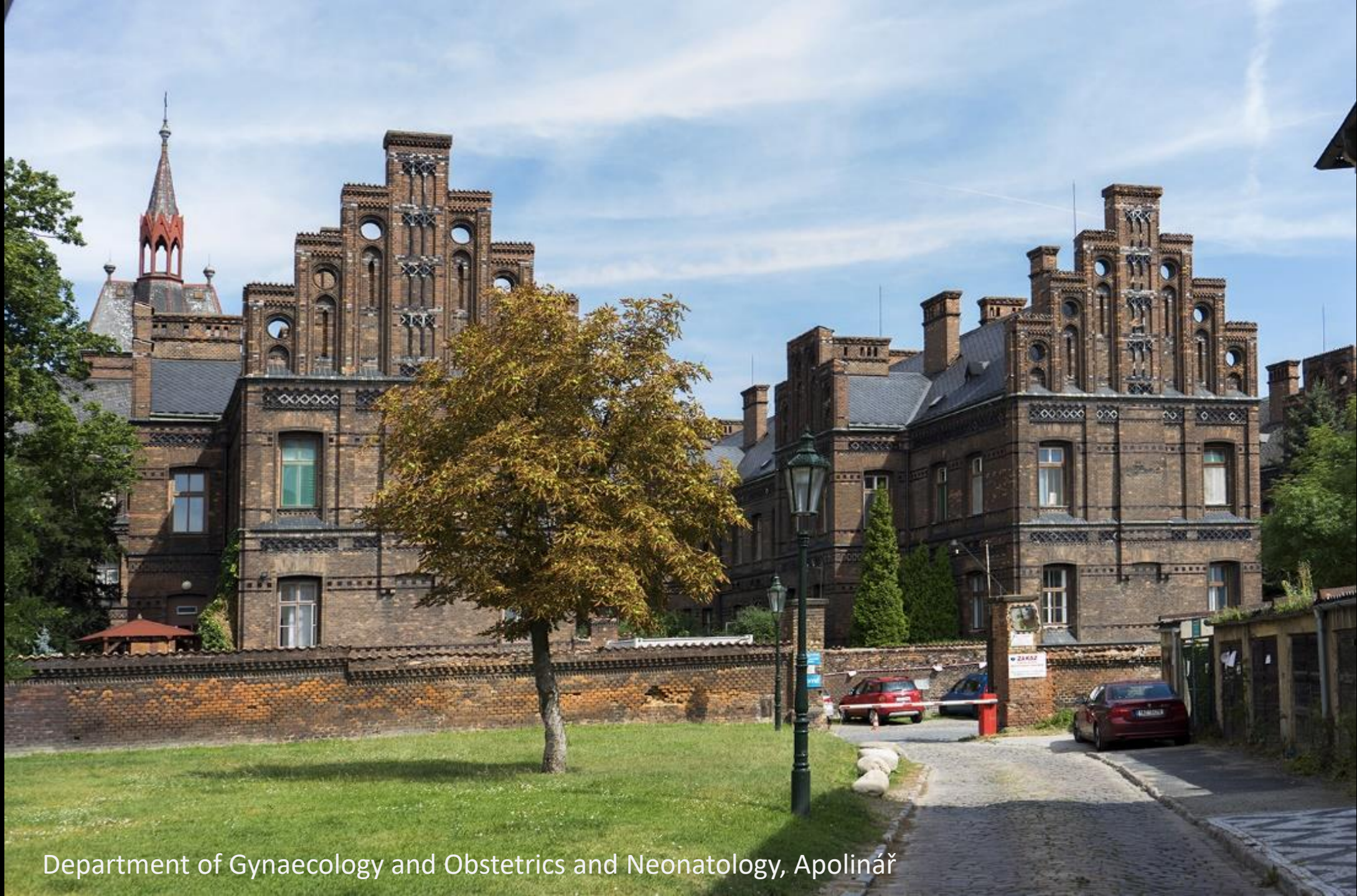
Department of Gynaecology and Obstetrics and Neonatology, Apolinář