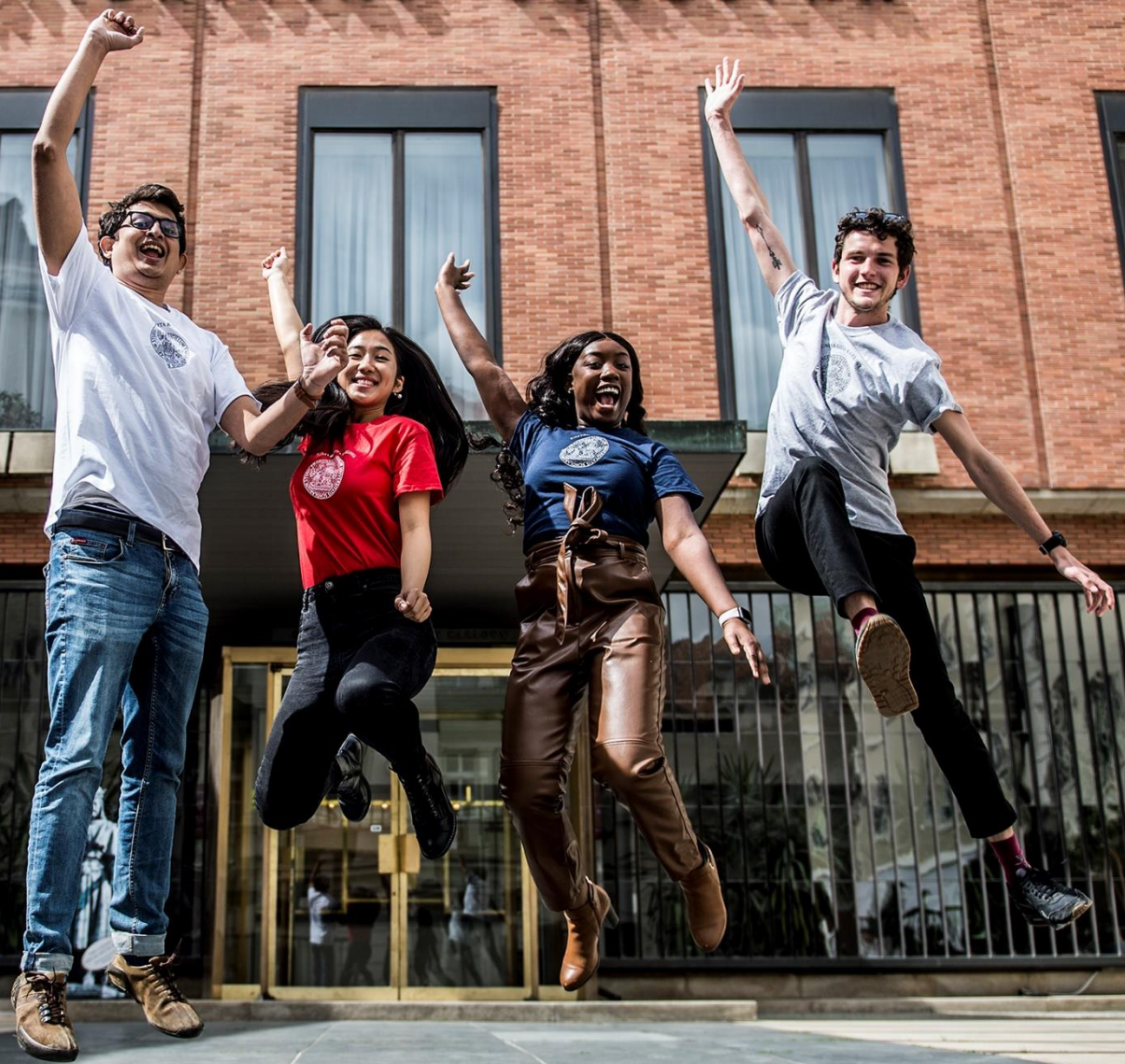
Carolinum, historical centre of Charles University