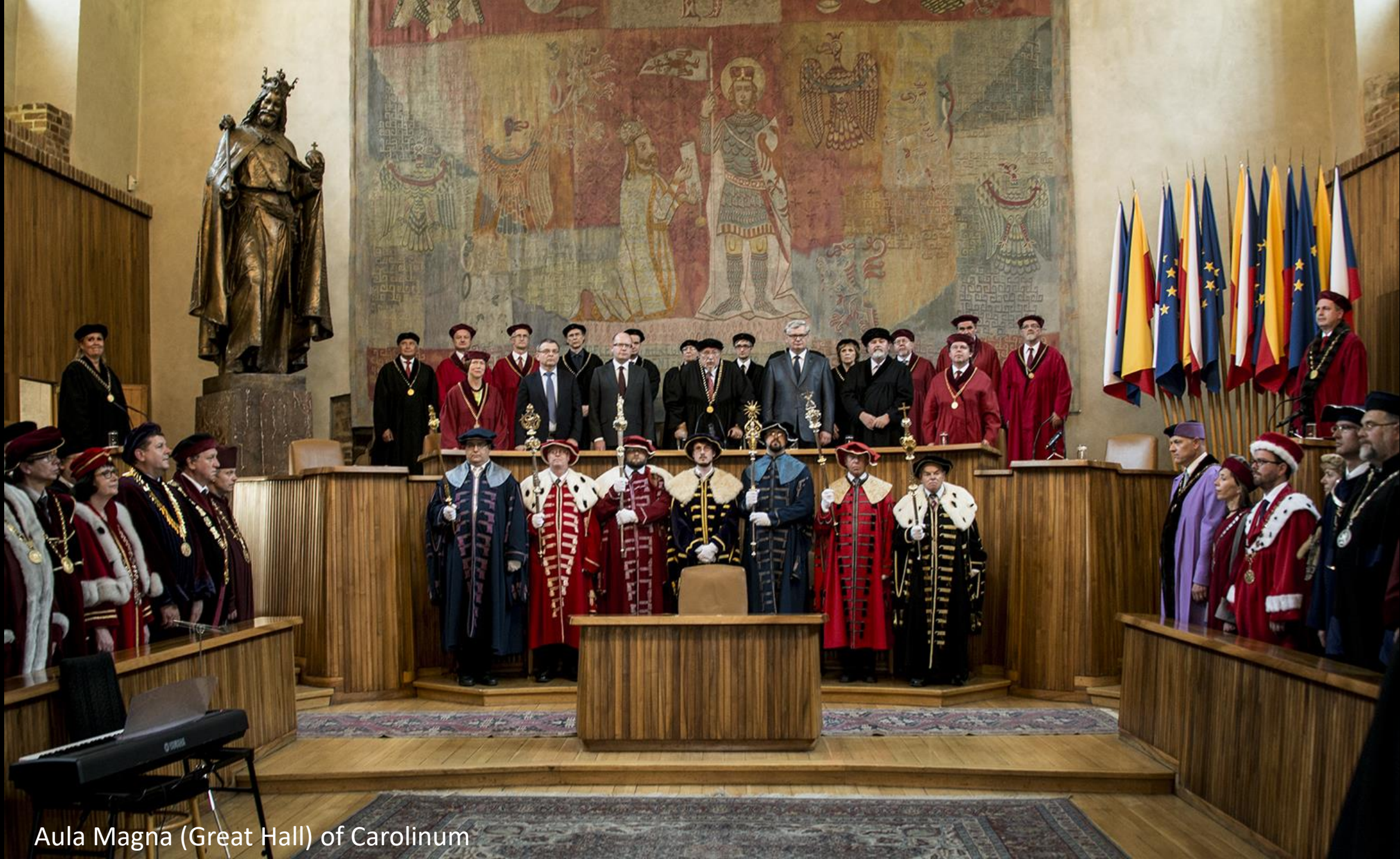
Aula Magna (Great Hall) of Carolinum