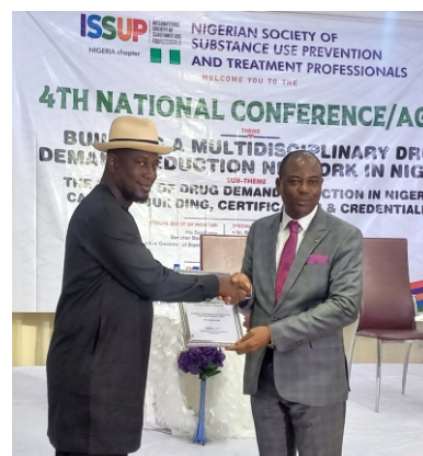
Bayelsa State Commissioner for Health with ISSUP Nigeria Chapter President at the Conference

One of his great contributions to the development of drug demand reduction is the approval of post graduate course in addiction studies in Niger Delta University in Bayelsa State, making the university one of the two universities that currently offer post graduate courses in addiction studies in Nigeria.